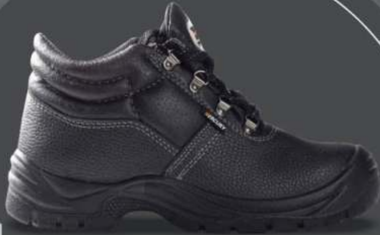
CLASSIC UTILITY BOOT